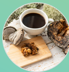
Adaptogenic lattes (matcha, chai, coffee)