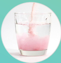
Functional hydration powders