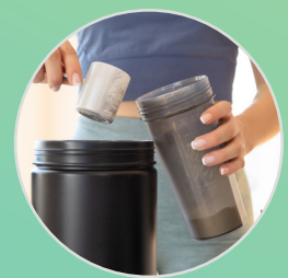
Sports performance and wellness formulations