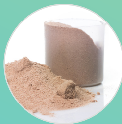
Protein blends and superfood mixes